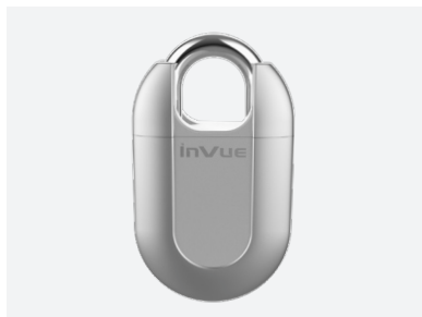
1 inch Shackle – Anti-cut Cover